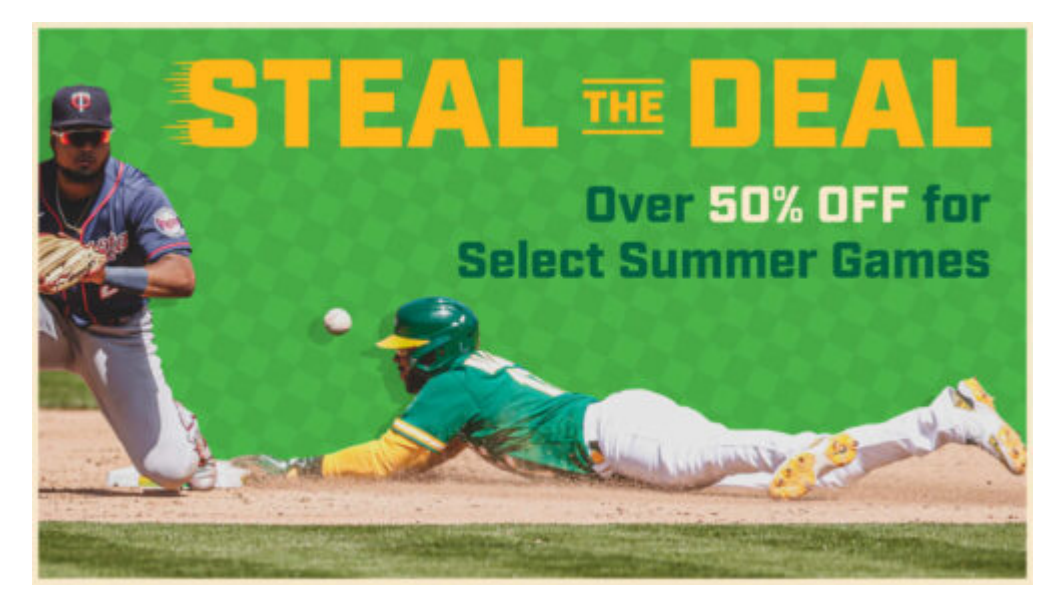
The A's "Steal the Deal" promotion directs fans to ongoing hefty ticket discounts.

Even in New York's Bronx, fans can find $10 grandstand tickets to every game. (Those with <u>Mastercard</u> bank cards can occasionally even get in for half that at the half-dozen or so Mastercard $5 Games.) This summer for families, Yankee