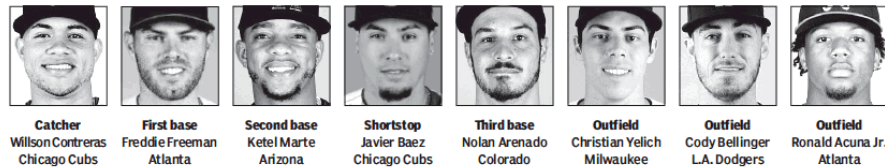
Catcher Wilson Contreras Chicago Cubs First base Freddie Freeman Atlanta Second base Ketel Marte Arizona Shortstop Javier Baez Chicago Cubs Third base Nolan Arenado Colorado Outfield Christian Yelich Milwaukee Outfield Cody Bellinger L.A. Dodgers Outfield Ronald Acuna Jr. Atlanta