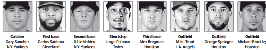
Catcher Gary Sanchez N.Y. Yankees First base Carlos Santana Cleveland Second base DJ LeMahieu N.Y. Yankees Shortstop Jorge Polanco Twins Third base Alex Bregman Houston Outfield Mike Trout L.A. Angels Outfield George Springer Houston Outfield Michael Brantley Houston