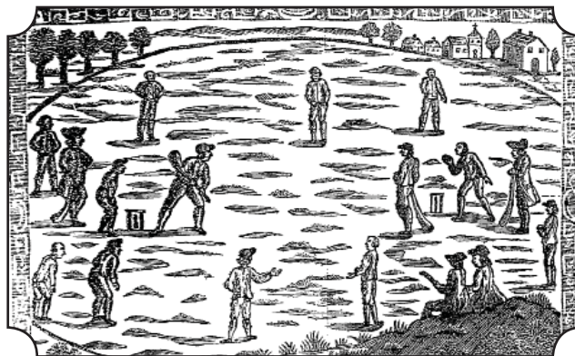
Cricket in 1744

HENRY CHADWICK in 1876: "What Cricket is to an Englishman, Base-Ball has become to an American. . . . On the Cricket-field—and there only—the Peer and the Peasant meet on equal terms; the possession of courage, nerve, judgment, skill, endurance and activity alone giving the palm of superiority. In fact, a more democratic institution does not exist in Europe than this self-same Cricket; and as regards its popularity, the records of the thousands of Commoners, Divines and Lawyers, Legislators and Artisans, and Literateurs as well as Mechanics and Laborers, show how great a hold it has on the people. If this is the characteristic of Cricket in aristocratic and monarchical England, how much more will the same characteristics mark Base-Ball in democratic and republican America."