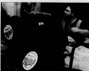
...and unpacks the Twins' equipment for their game later that night against Cleveland. The Twins won it 4-3. It was the first three-team doubleheader in the majors in 43 years.