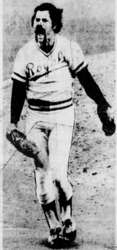
Kansas City relief pitcher Al Hrabosky shouted with glee Wednesday as he walked from the mound after the Royals beat the Yankees 10-4.