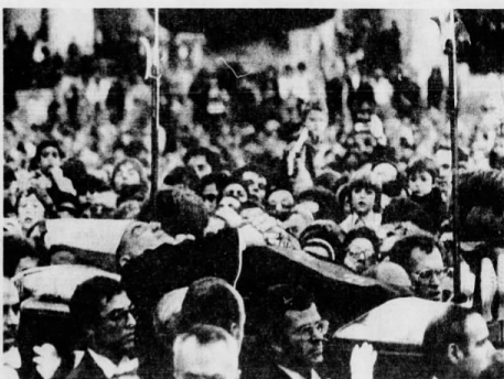
The body of Pope John Paul was carried across St. Peter's Square to the basilica Saturday to lie in state.

But the spirit was not limited to the drive for excellence that had been launched earlier that year with a similar rhetoric. The university would make a leap for the year by giving up some of its programs and concentrating on the ones it could do best. With sufficient effort, people were saying, the university could become as good as the University of Michigan, if not Harvard.