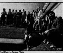
This crowd watched from the top of the First Covenant Church.