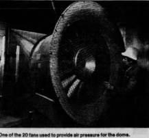
One of the 20 fans used to provide air pressure for the dome.