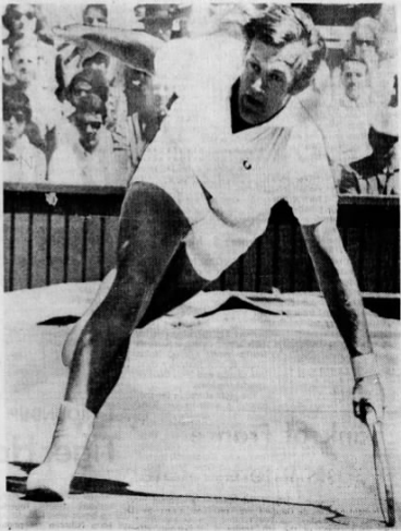
AUSTRALIA'S TONY ROCHE USED HIS RACKET TO RETAIN BALANCE Roche eliminated Clark Graebner in Wimbledon semifinals