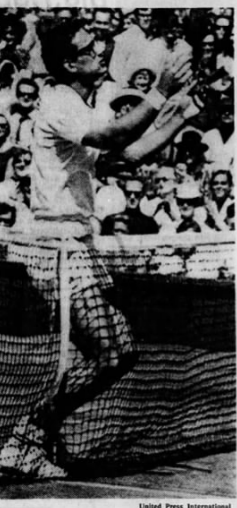
CLARK GRAEBNER RAISED HANDS IN DESPAIR New Yorker lost to Aussie Tony Roche