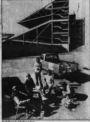
At Metropolitan Stadium, members of the "Save the Met" group staged a sit-in near the left-field bleachers.