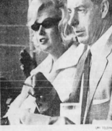
MARILYN MONROE, LOU DIMAGGIO WATCHED Actress, ex-Yankee star sits with Twins

NEW YORK—Pedro Ramos yielded only three hits Tuesday to ease the Minnesota Twins a 6-0 opening-day victory over the New York Yankees, defending champions in the American league. It was the first regular-season game for the Minnesota Twins, who up to last year were the Washington Senators.