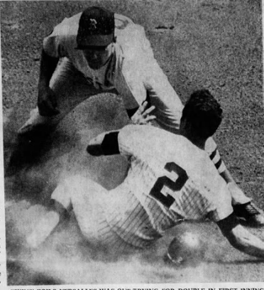
Twins ZOLO VERSALLES WAS OUT TRYING FOR DOUBLE IN FIRST INNING Boston's Rico Petrocelli made out on throw from right fielder Tony Cavigliaro