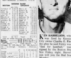
KEN HARRELSON, who was fired by Kansas City owner Charlie O. Finley after he said Finley was "bad for baseball," was signed by the Boston Red Sox Friday night. Harrelson will join the Red Sox Monday.