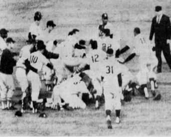
New York and Boston players poured onto the field and over each other in melee during Wednesday's game